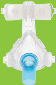
BiTrac NIV Nasal

ValueTrac NIV Ribbed Nasal Mask (Bilevel/CPAP/Ventilator Applications) w/ Standard Elbow 22mm Female, Foam Forehead Pad