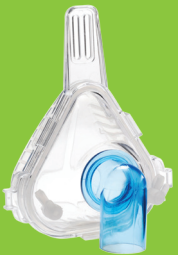
ValueTrac NIV Ribbed Nasal