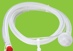
BiTrac NIV Circuit