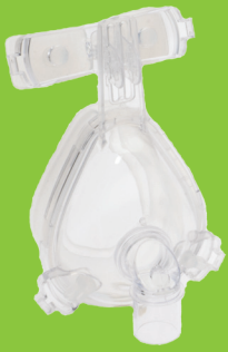
BiTrac NIV Full Face

BiTrac SE NIV Full Face Mask (Ventilator Application) w/ Standard Elbow 22mm Female, OmniClip w/ Silicone Forehead Pad