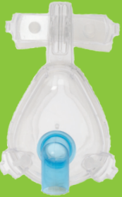
BiTrac NIV SE Full Face

BiTrac NIV Nasal Mask (Bilevel/CPAP/Ventilator Applications) w/ Standard Elbow 22mm Female, OmniClip w/ Silicone Forehead Pad